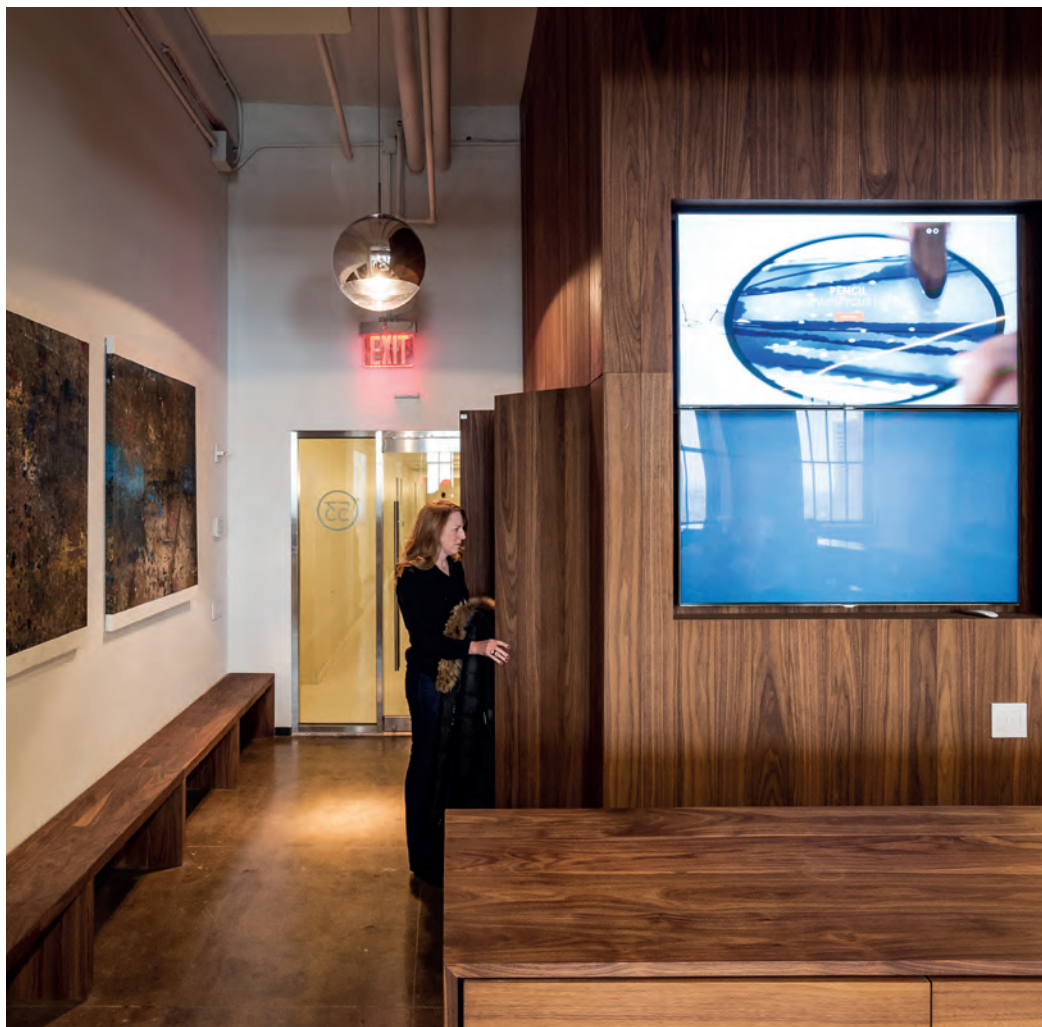
↑ | Lounge area ← | Entry hall